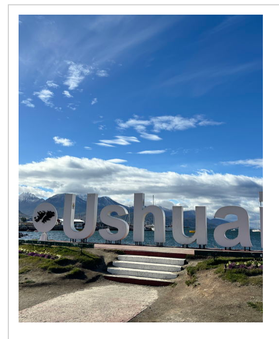
Tierra Del Fuego - "Land of Fire"

Tierra del Fuego or "Land of Fire" is a breath taking island divided between Argentina and Chile and a must see destination for anyone travelling to Patagonia.